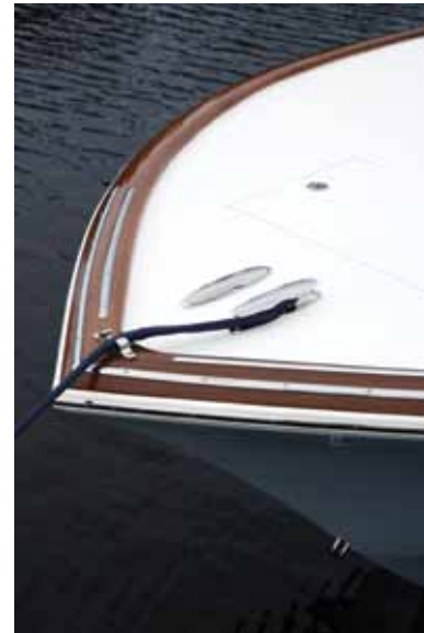
Thick Mahogany toe rail with welded stainless steel rub rails.